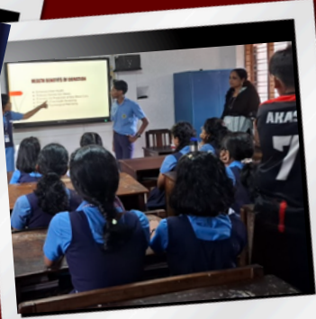
World Blood Donor's Day