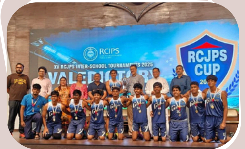
Rajagiri Christu Jayanti Public School Inter-School Basketball Tournament U-19 - First Prize