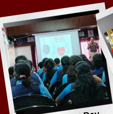
World Heart Day