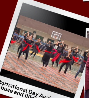
International Day Against Drug Abuse and Illicit Trafficking