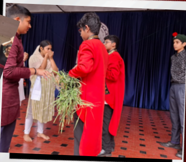
Quit India Day