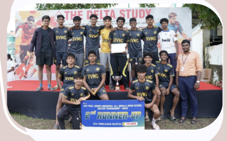
Delta Study Football Tournament Third Prize