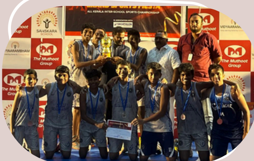
Grand Sports Fiesta, Sanskara School U-14 Basketball - Second Position