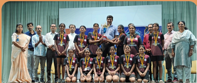
CBSE Cluster XI Volleyball Tournament, Assisi Vidyanikethan U 14 - First