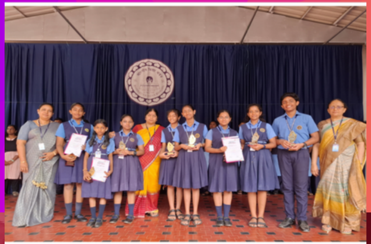
Cochin Shipyard All Kerala Children's Fest 2025