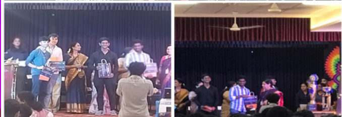
Srishti Yuktara 2025 – Bhavan's Munshi Vidyashram