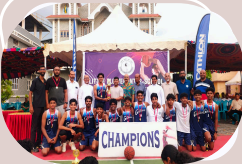
Little Flower Seminary School Basketball Tournament U-19 First Prize