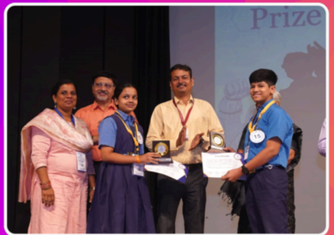
All India Bharatiya Vidya Bhavan Science Exhibition THIRD