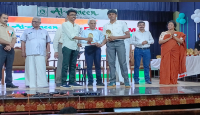
AL AMEEN PUBLIC SCHOOL QUIZ FIRST