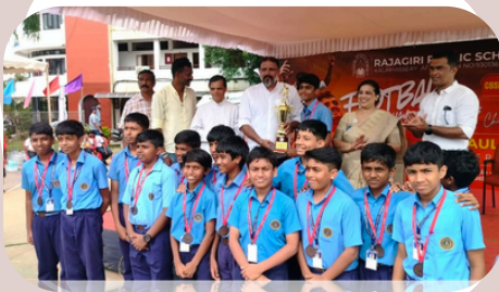
The U14 team reached the semi-finals of the CBSE Clusters XI