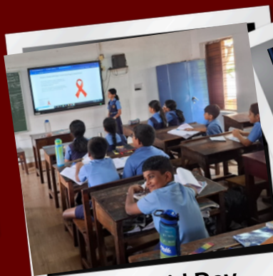
First Aid Day