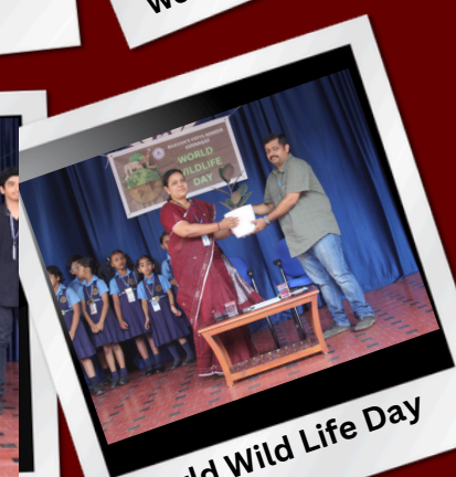
World Wild Life Day