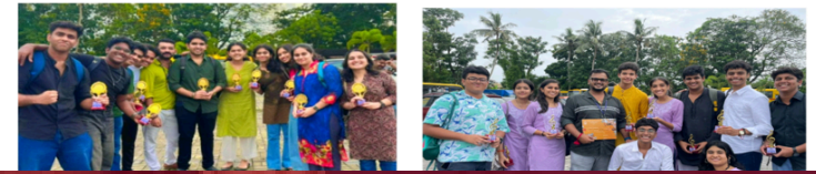
Chaithanya Inter-School Fest, Chinmaya Vidyalaya, Vaduthala