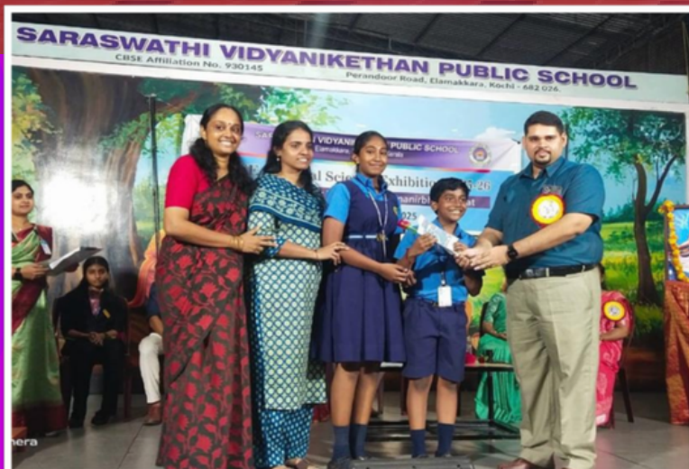
CBSE Regional Science Exhibition 2025-2026