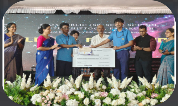
CELESTA FIESTA- Q Collective SECOND