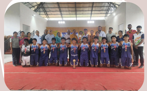
Christava Mahilalayam School, Aluva Inter-School Basketball Tournament U17 - First Prize