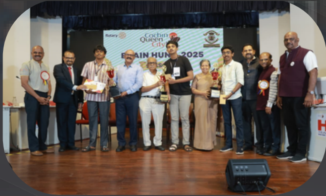
BRAIN HUNT – ROTARY CLUB COCHIN FIRST