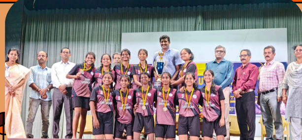
CBSE Cluster XI Volleyball Tournament, Assisi Vidyanikethan U 17 - First