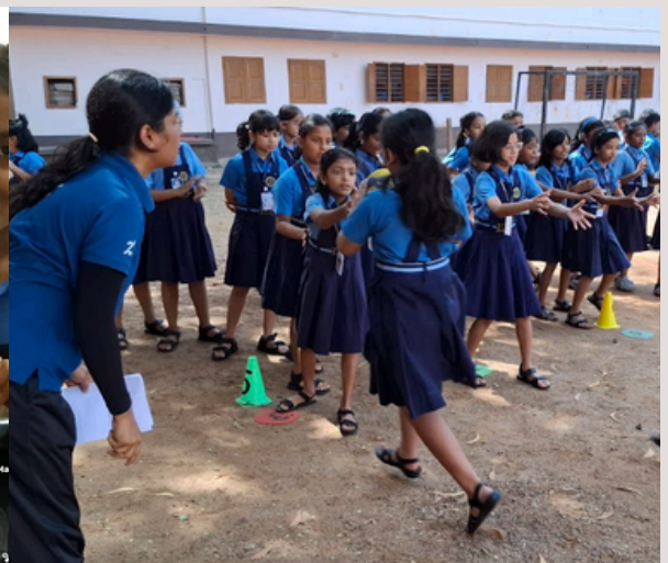
Kochi, Kerala, भारत