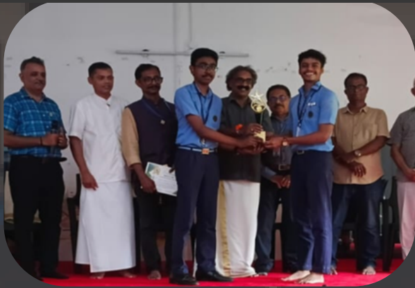
Bharat ko Jano Quiz - Bharath Vikas Parishad SECOND