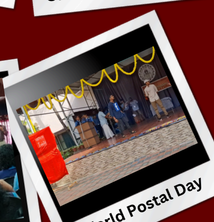
World Postal Day