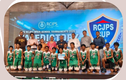
Rajagiri Christu Jayanti Public School Inter-School Basketball Tournament U-14 - First Prize