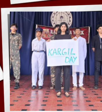
Kargil Vijay Diwas