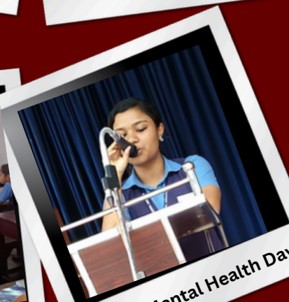
World Mental Health Day