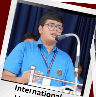
International Literacy Day