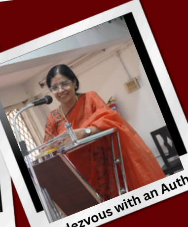
Rendezvous with an Author