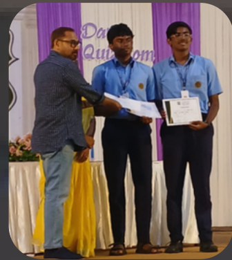
DAWN QUIZDOM SECOND