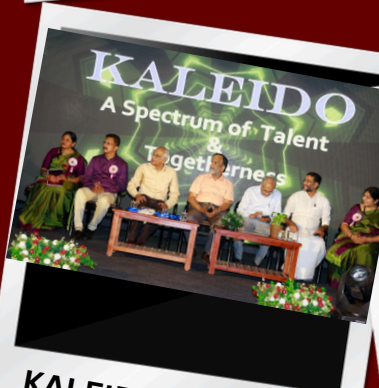
KALEIDO - PTA Day