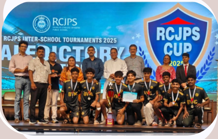
Rajagiri Christu Jayanti Inter-School Football Tournament U19 - First Prize